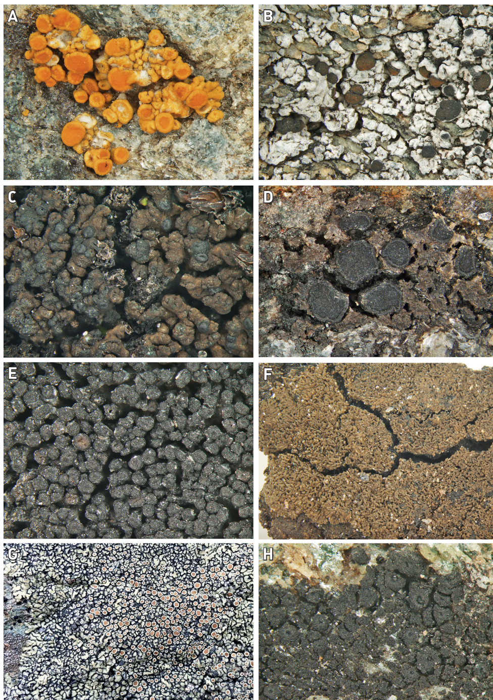
Fig. 3. Interesting lichens recorded during our research II. A – Caloplaca approximata JV 28047. B – Caloplaca fuscorufa JV 27890. C – Fuscopannaria aff. praetermissa JV 27772. D – Halecania spodomela JV 27818. E – Lempholemma isidiodes ZP 35008. F – Placynthium pulvinatum JV 27769. G – Protoparmeliopsis bolcana . H – Thelignya lignyota JV 27897.